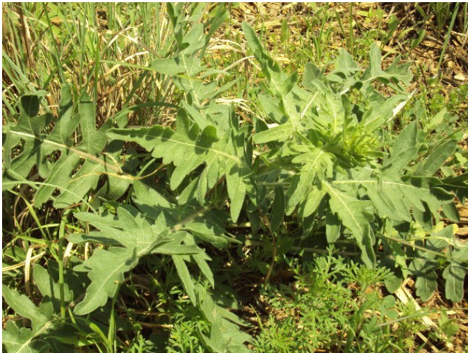
Cutleaf Daisy, Engelmannia peristenia