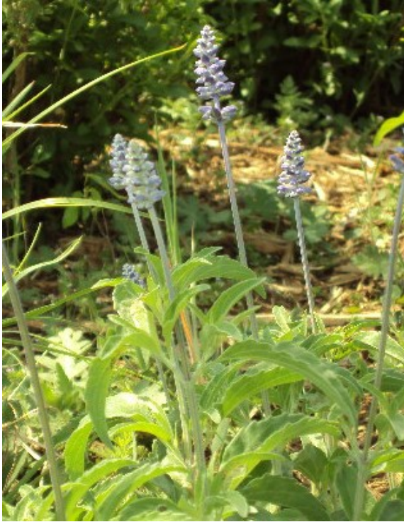
Mealy Sage, Salvia farinacea

Spring Creek Forrest Preserve: Demonstration Bed Bloomers on April 9. The Autumn Sage was showing very little color, so I thought I would focus on some of the other plants in our bed.