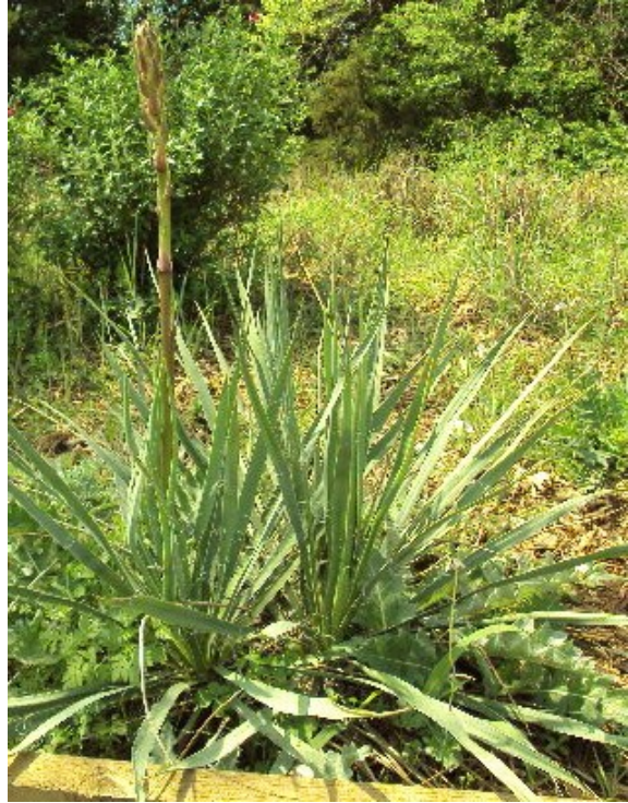
Unknown Yucca, perhaps Yucca arkansasa