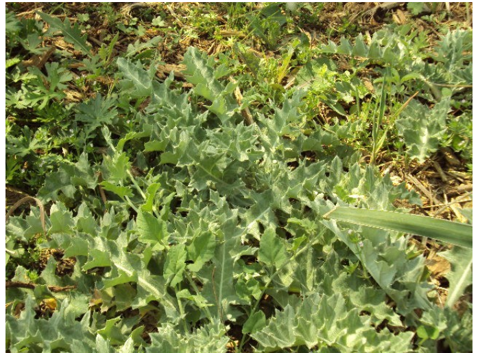
Unknown thistle that seeded out in the bed