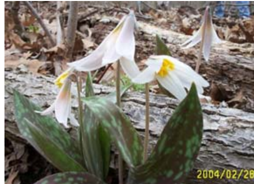
Erythronium albidum Trout lily or Dogtooth violet at Spring Creek Forest Preserve February 2004

Workday Saturday February 24, 2007 at about 11:30 (in between Trout Lily walks.) Join us in cleaning up our chapter's demonstration garden next to the parking lot at Spring Creek Park Preserve, 1787 Holford Road, Garland across the street from where the walks will be held. Bring gloves, weeding tools and water.