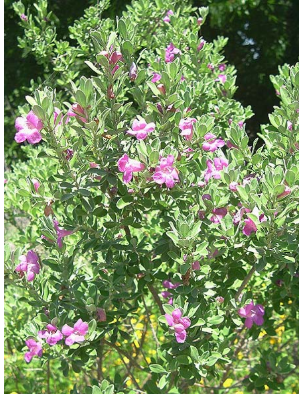
Cenizo-Green Cloud cultivar

Adapted from the Website of the Boerne Chapter of NPSOT