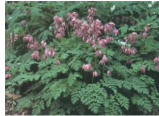
Dicentra Formosa Bleeding Heart