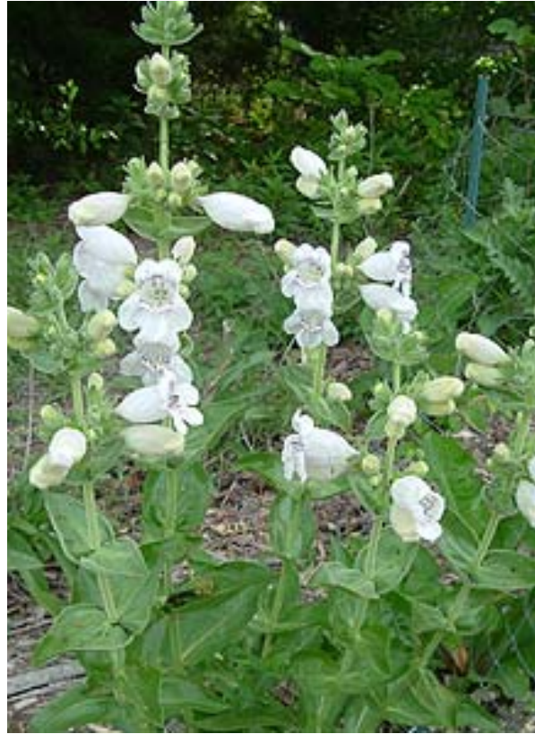
Penstemon cobaea –from stock rescued from Plano tree farm a few years ago

Editors note: The specimens in my yard faired very well this past year with little or no supplemental water and are preparing to send up their flower stalks.