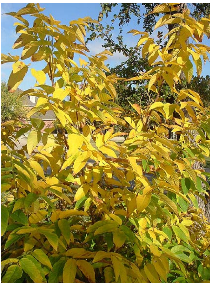
Fall color of Mexican Buckeye ( Ungnadia speciosa )