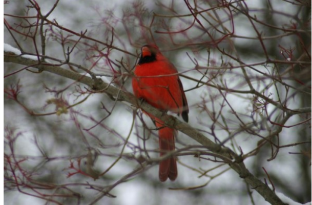
A male cardinal rests during winter. Attract more birds with fresh water and birdseed.

For Garden Walks, meet us by the Grand Hall. Admission is $3 for adults, $2 for seniors and $1.50 for children. Garden members are free. For more info, reach us at (214) 428-7476 x 23 or contact@texasdiscoverygardens.org