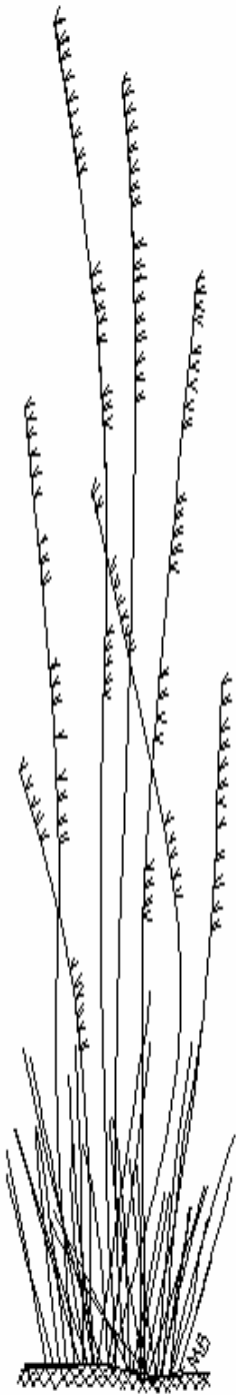
Sideoats Grama ( Bouteloua curtipendula )

Sun, attractive seed form on one side of stems, state grass of Texas, attracts birds and butterflies, two to three feet tall.