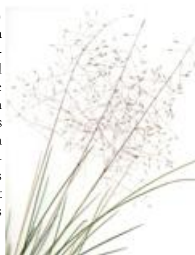
Sam C. Strickland

The selection for September is Gulf Coast Muhly ( Muhlenbergia capillaries ) also known as hair-awn muhly. This is a perennial grass that is beautiful in the fall with purple seed heads that sway in the breeze. It attracts birds and can be used in mass or a structured garden. It grows 2'x2' and is a low-water requirement for sunny locations; it has a high resistance for deer.