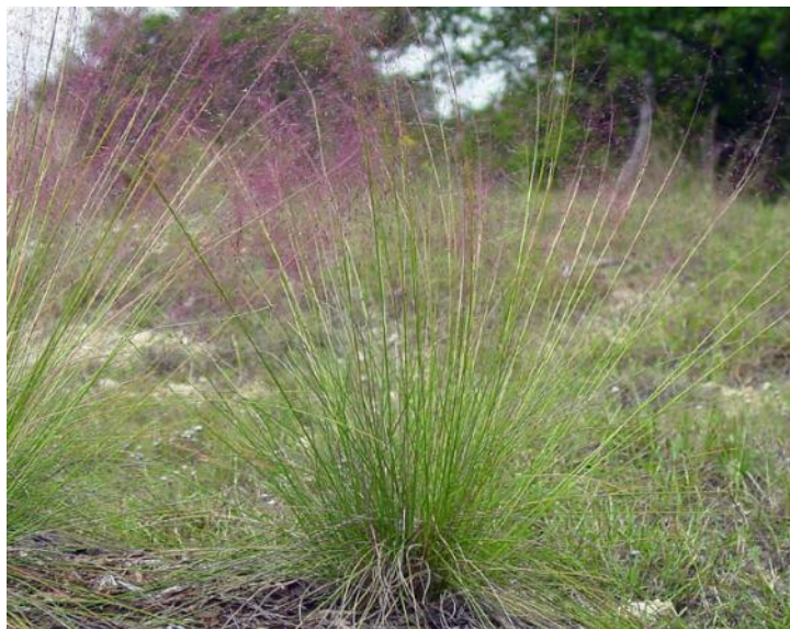
Sam C. Strickland

The selection for September is Gulf Coast Muhly ( Muhlenbergia capillaries ) also known as hair-awn muhly. This is a perennial grass that is beautiful in the fall with purple seed heads that sway in the breeze. It attracts birds and can be used in mass or a structured garden. It grows 2'x2' and is a low-water requirement for sunny locations; it has a high resistance for deer.