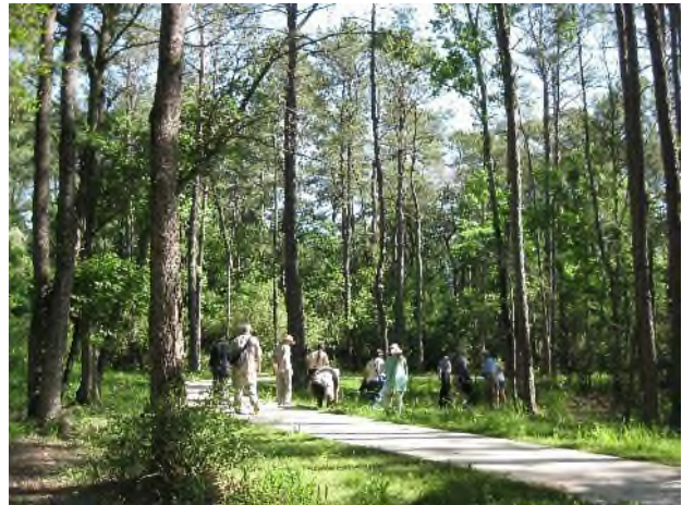
Field Trip to Keith Weiss Park