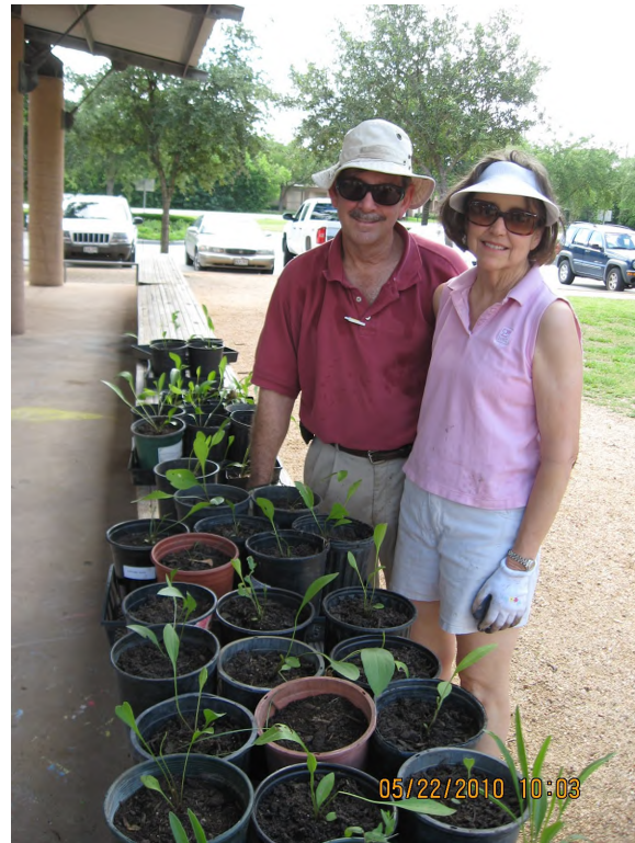
May 22 Blazingstar workday

Project Blazingstar is a multiyear joint effort of the Hermann Park Conservancy (HPC), Coastal Prairie Partnership (CPP), and Texas Master Naturalists to restore three small but highly visible areas in Hermann Park back to native prairie to preserve the natural ecosystem of this area and to create better habitat for birds, butterflies, rabbits, and other park wildlife.