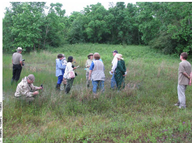
Members enjoy field trip to U of H Coastal Center