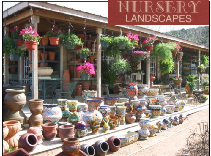
SIGNS OF SPRING abound at Alltex Nursery