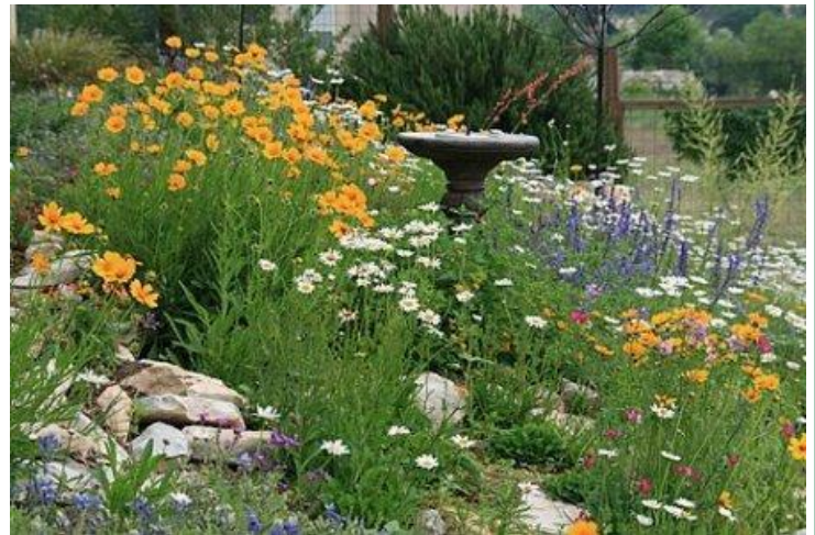
NPSOT member Sharon Walling's beautiful and water-saving landscape took first place in last year's contest.

For more info, rules and entry form, go to http://www.hgcd.org/landscape.html or call 896-4110 and ask to receive the landscape contest entry form by mail. You will be asked to submit a completed Contest Entry Form with three (3) photos of the front landscape.