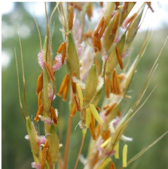
Indiangrass seed heads mature between Sept. and November and make a stunning fall accent.