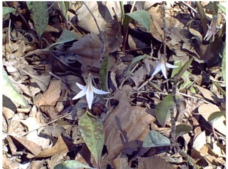
Trout Lilies