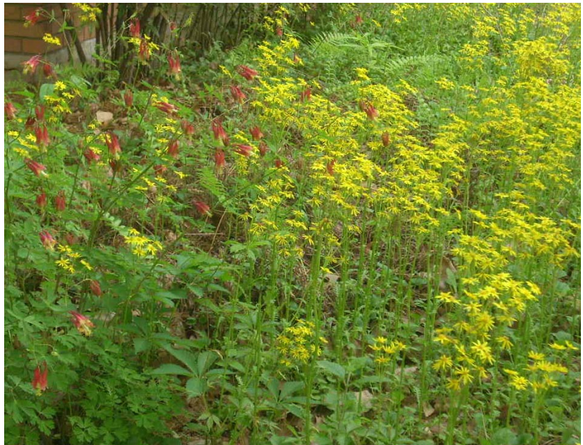
Red Columbine (Aquilegia canadensis) & Golden groundsel (Packera obovatus) by Mike Mizell