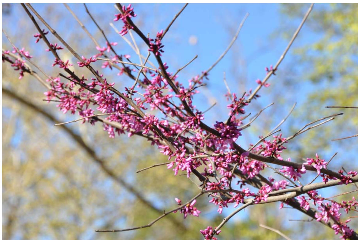
Redbud in blossom