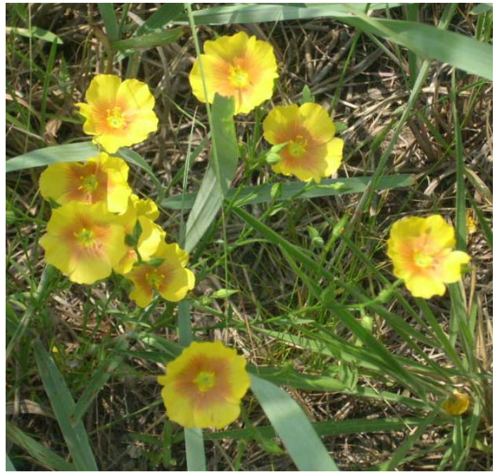
Yellow Flax