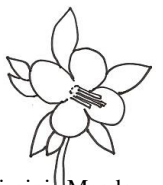
Virginia Meadow-beauty ( Rhexia virginica )

Eastern Hop-hornbeam ( Ostrya virginiana ) Red Bay ( Persea borbonia ) Carolina Rose ( Rosa carolina ) Prairie Rose ( Rosa setigera ) Sassafras ( Sassafras albidum ) Coral-berry ( Symphoricarpos orbiculatus ) Farkleberry ( Vaccinium arboretum ) Arrowood Viburnum ( Viburnum dentatum )